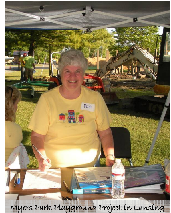
Myers Park Playground Project in Lansing

Putting your time and talent to work for our community